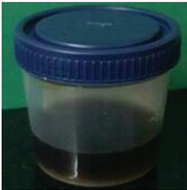
Figure 2: Black discoloration of urine.

and AcT 5 Diff Beckman Coulter (a fully automated hematology analyzer) because blockage of probes could damage them. Also whether the results would be reliable or not. We decided to proceed with the tests. Liver function tests were totally deranged with total bilirubin level being 9.6 mg% (direct